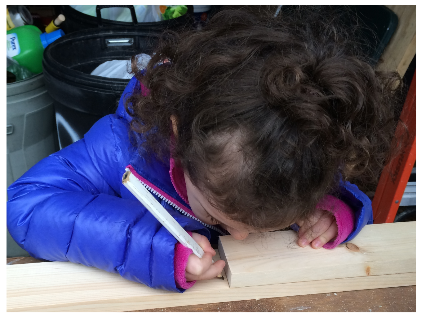
My little helper measuring out our next cut!

If you have any questions about this project, please feel free to leave a comment here or on Facebook!