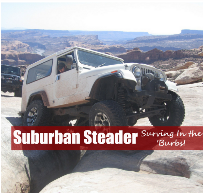
Suburban Steader Surviving In the 'Burbs!