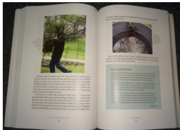
The Weekend Homesteader – Planting Trees