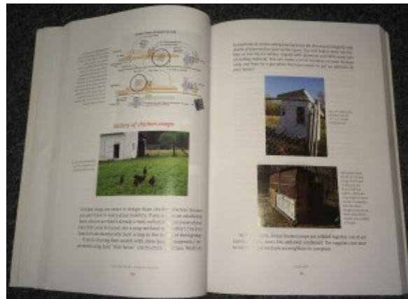
The Weekend Homesteader – Building A Chicken Coop

Anna obviously put a lot of thought into The Weekend Homesteader . There is a large attention to detail in this book shown by the continuity of projects – there's instruction on soil management one month and planting the next – to the simple but aesthetically pleasing way it is laid out. To me, the pictures are what really make the book.